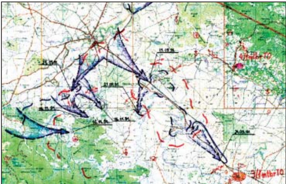
Picture 12: Gospić 10.-11.1991 - Plan of the Croatian military - police operation, autumn 1991.

"From the front defence lines of Lički Osik 129 the enemy has shelled the Gospić - Perušić 130 main road. It was only a question of when our defence lines would break at their weakest link. Gospić was the political and strategic centre of Lika's. To win or